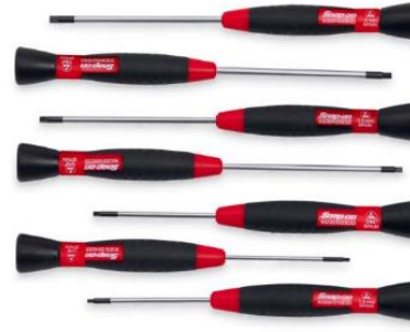
SGDEH70ESD Hex Set