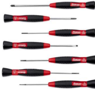
SGDE70ESD Combo Set