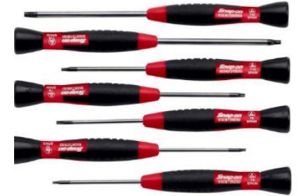
SGDET70ESD Torx® Set